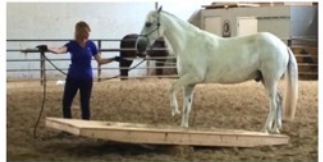
"Lawrance showed me what this human needed to do for that horse, at that exact moment."

Questions? MSranchLV@gmail.com 208-300-7039 Registration: JGarro999@gmail.com 208-219-0163 Deposit: $60 holds your spot!! Don't delay, these fill up fast.